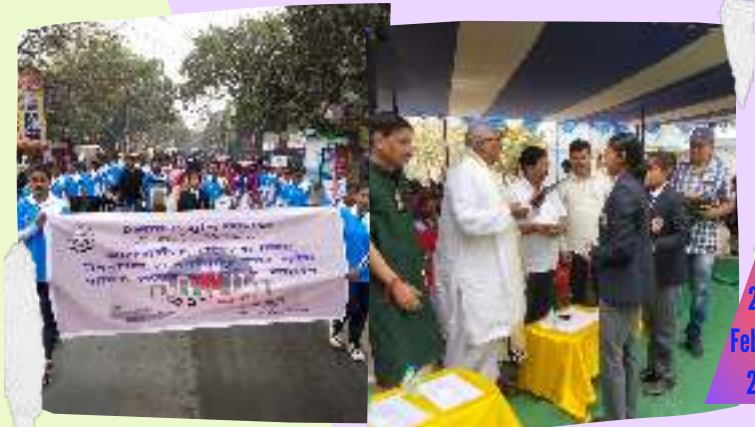
Kolkata RD Selection Camp

Volunteering Work on Inter National Mother Language Day