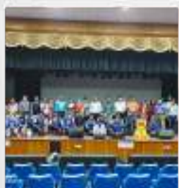
NSS Day programme by WBSU NSS Cell