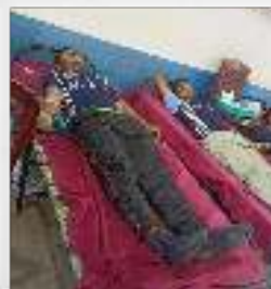
Organized a Blood Donation Camp