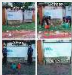
Clean India Drive