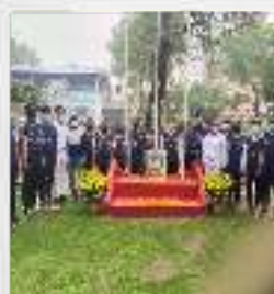
Netaji Birthday Celebration