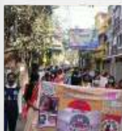
International Mother Language Day by Dept. of Bengali