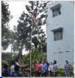
Independent Day Celebration