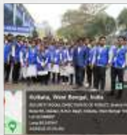
WB Govt. programme for L.S.