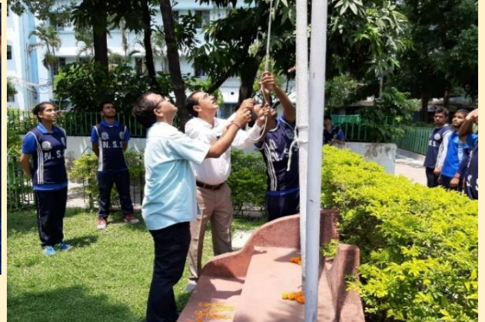
A glimpse of the various activities of the NSS Unit in the 2019-20 academic session