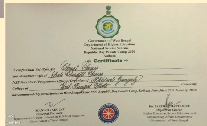
Some certificates obtained by the NSS volunteers during the 2019-20 academic session