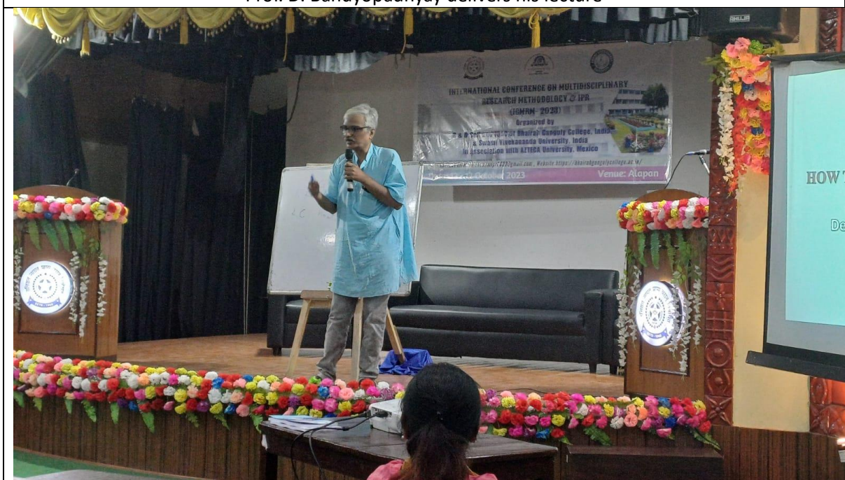
Participants are presenting