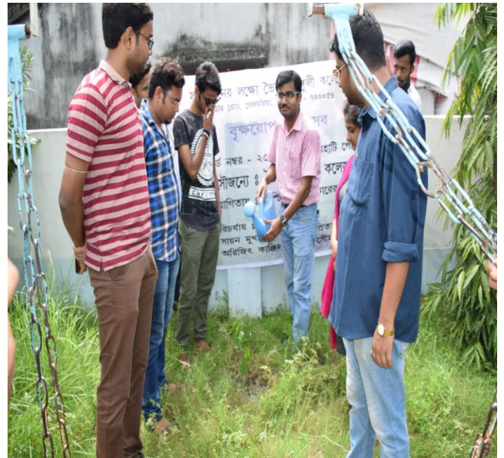
14. Operation Green Neighbourhood conducted through plantation of saplings in the adjacent Ward of Kamarhati Municipality on 27.08.19