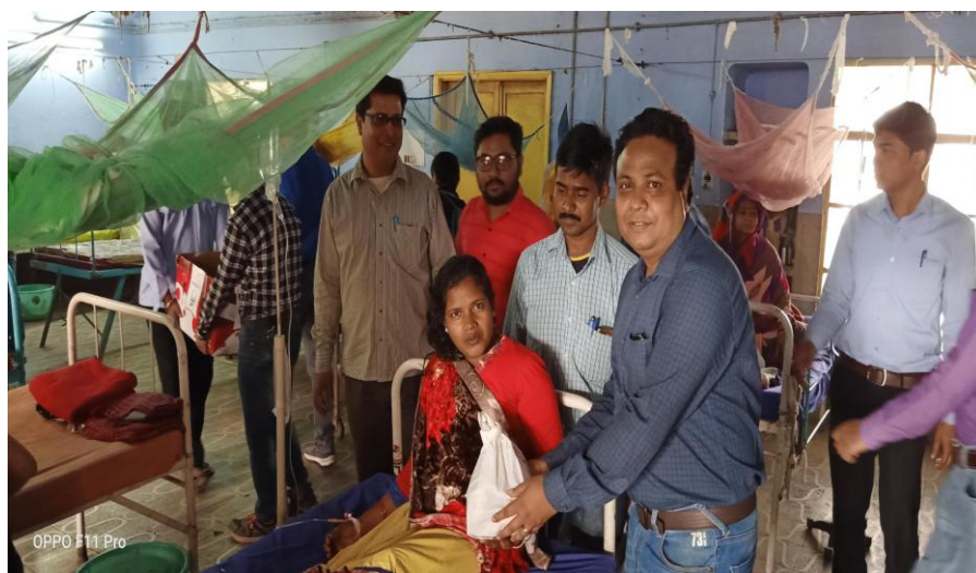
Distribution of Food packets to Kamarhati ESI Hospital on 22.02.20