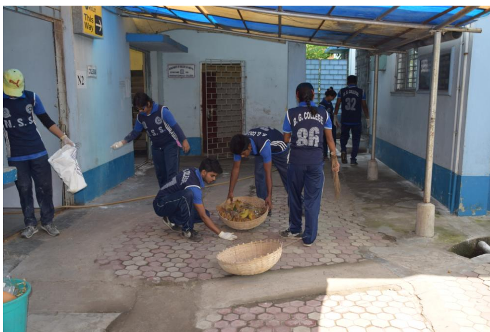
World Environment Day as a part of 'Swachhta Bharat Summer Internship Programme' 05.07.18