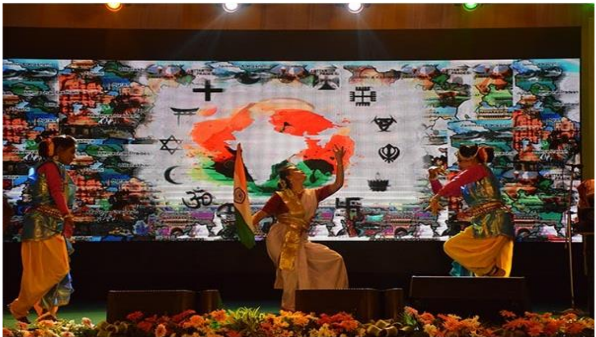
Sensitization of students and staff with patriotic sentiments through cultural performance