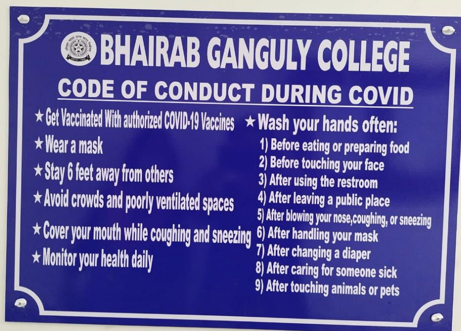
Awareness of students and employees during Covid through Code of Conduct boards placed at strategic points in college campus