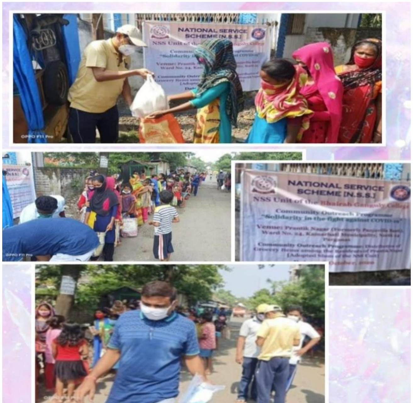
Sensitization of students through community outreach programmes like distribution of ration at Prantik Nagar slum during Covid- 19 lockdown period