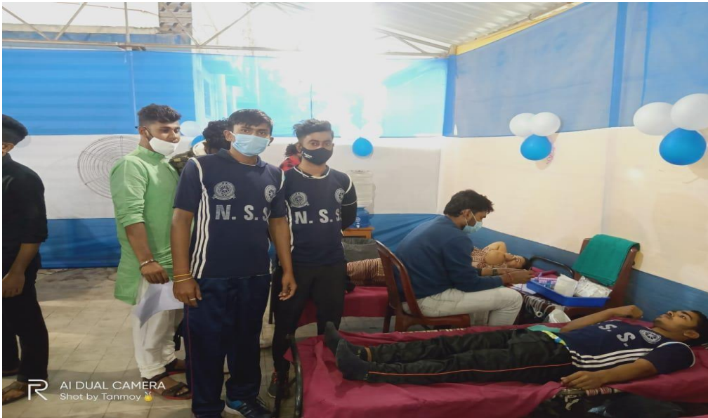
Blood Donation Camp organized by NSS volunteers on 24.12.21