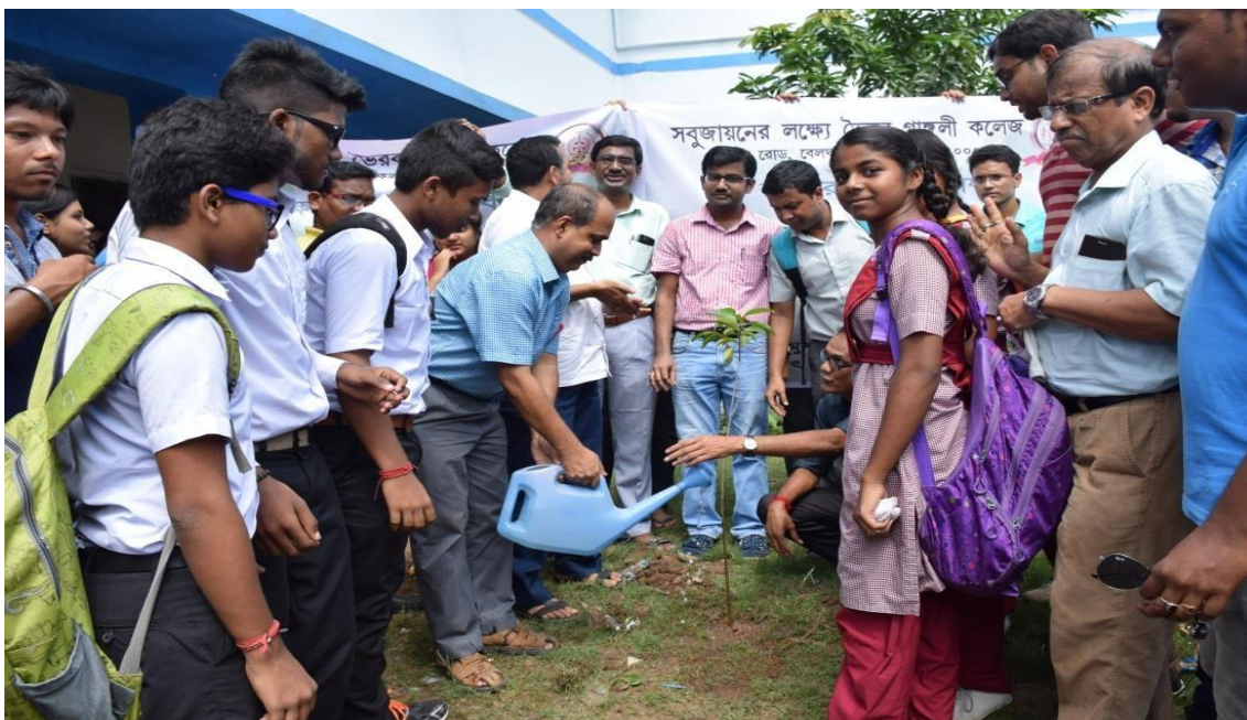
Sensitization of neighbouring school students through tree plantation drive within college campus