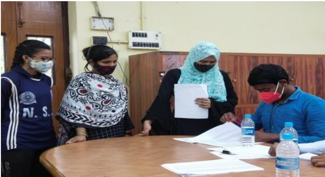
Volunteering work for Covid-19 Vaccination Camp on 7 th & 8 th October, 2021 by college staff to inculcate values of charity and empathy