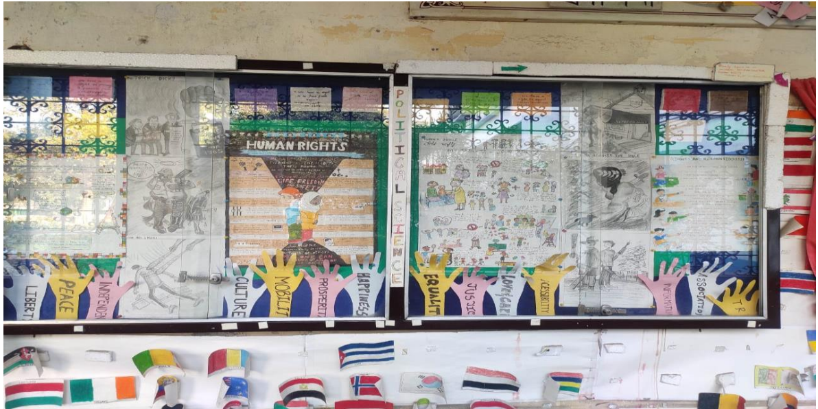
Constitutional consciousness displayed by the students of Political Science in their wall magazine